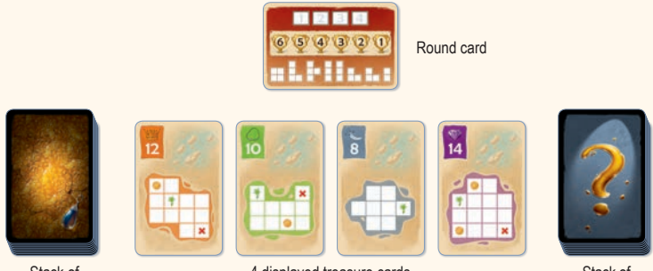
Stack of treasure cards

The 8 expedition cards are also shuffled and placed next to the displayed cards as a face down stack of expedition cards. Finally, any player is chosen as the player to start the game. Note: The start player always changes during the game after action 3 in a clockwise direction.